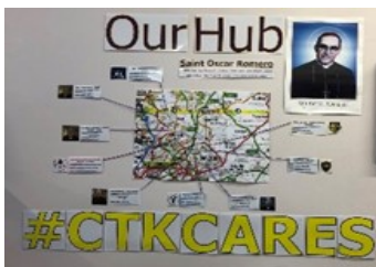
FRONT ENTRANCE (HUB)