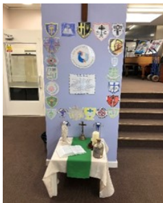
FRONT ENTRANCE (TRUST)