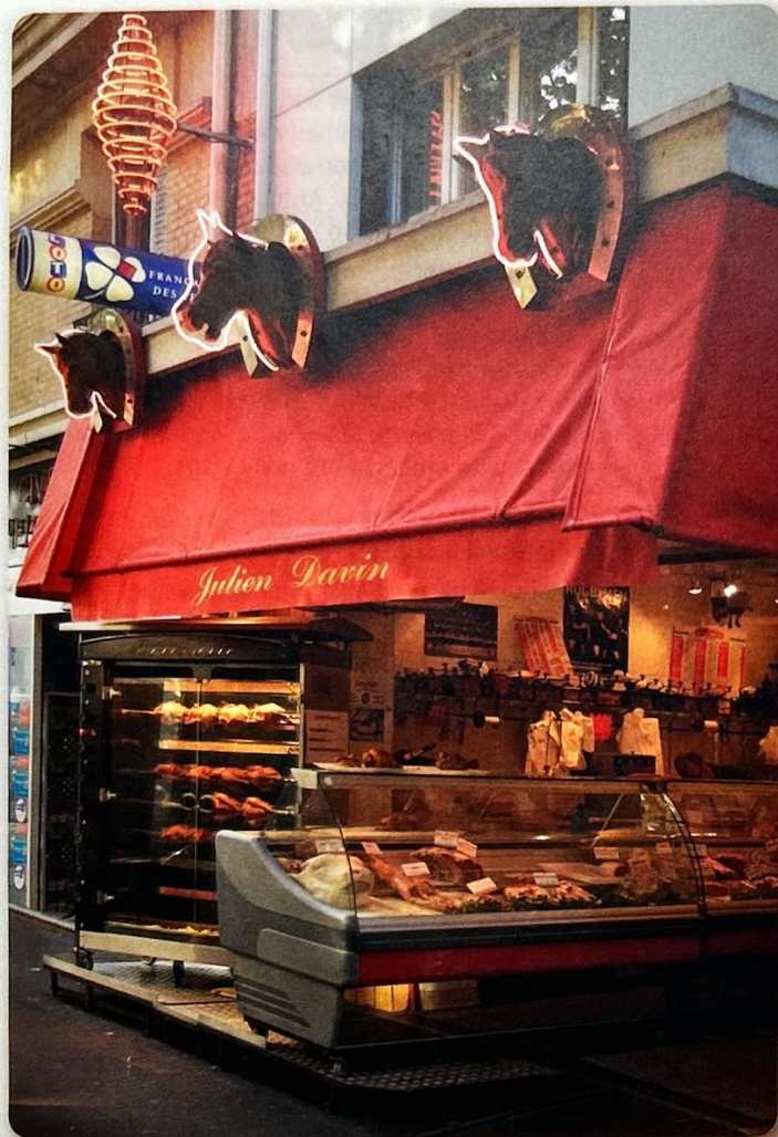
▲ Horsemeat butchers, France

whereas in others only one is allowed (monogamy). Similarly, some cultures have taboos on specific foods, or rules about what foods may be eaten together.