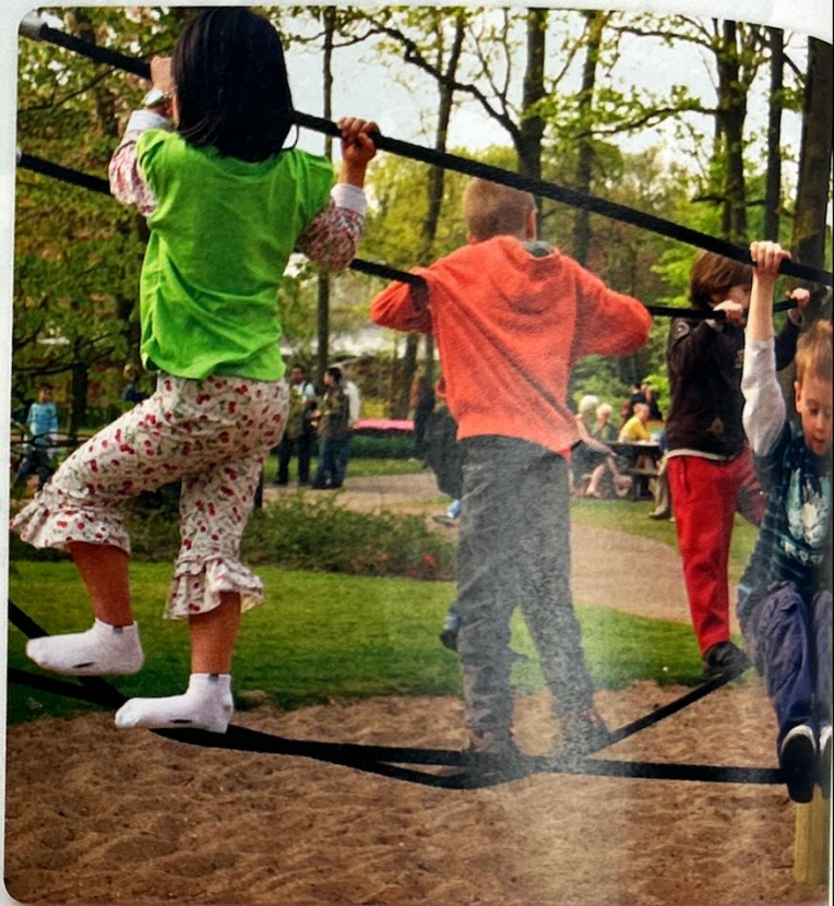
▲ Much of our learning occurs in our early years.

Sociologists therefore argue that biology and instincts cannot explain our behaviour, because most of it is learned, not inborn, and because it is not fixed for all members of our species, but varies between societies. As an alternative way of explaining human behaviour, therefore, sociologists use the two related ideas of culture and socialisation.